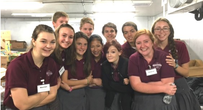
St. Thomas More volunteered on Nov. 4.