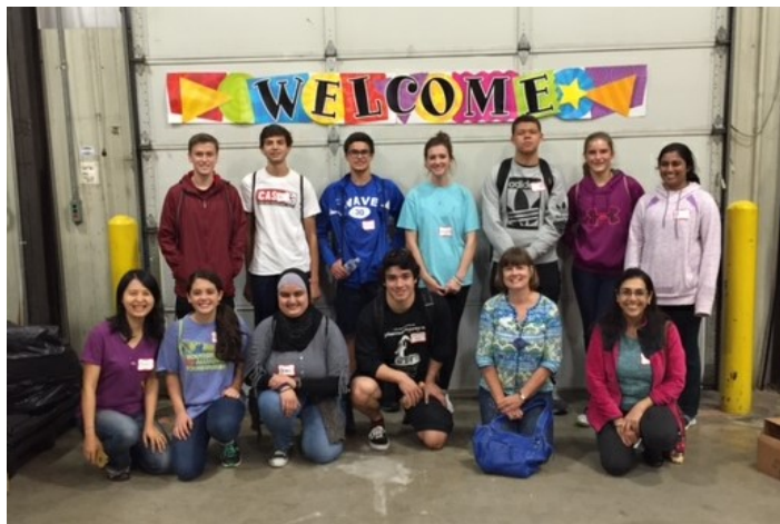
Raleigh Charter High School helped on Oct. 30.