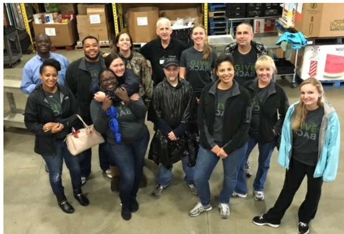
Allscripts volunteered on Nov. 2