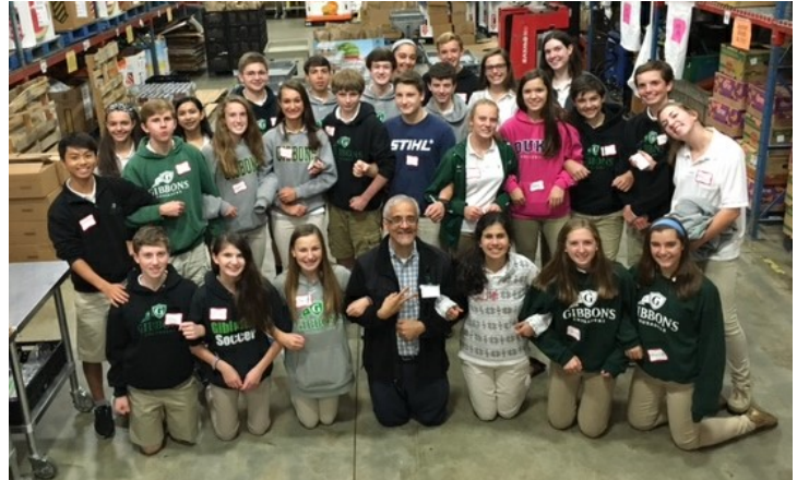
Cardinal Gibbons volunteered the afternoon of Oct. 27.