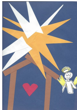
This year's Christmas honor card

FOR AS THE ANGEL SAID TO JOSEPH LONG AGO, HE SAVES HIS PEOPLE FROM THEIR SINS. PSALM 71:3 YOU HAVE MADE A COMMANDMENT TO SAVE ME, FOR YOU ARE MY ROCK AND MY FORTRESS.