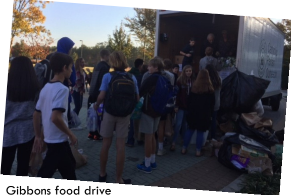
Gibbons food drive