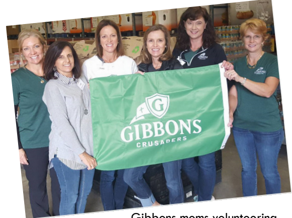
Gibbons moms volunteering