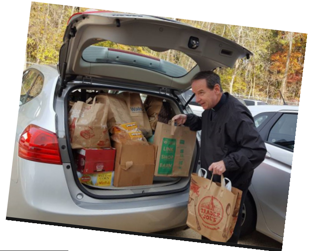
Bishop Burbidge helping Thanksgiving week