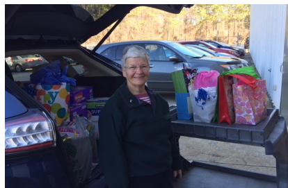
Lourdes Altar Guild donations

www.CatholicCharitiesRaleigh.org/golf-2018