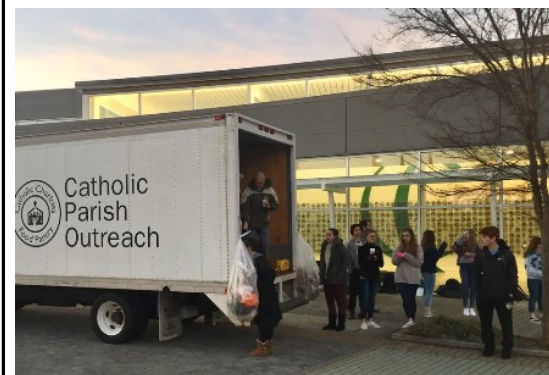
Gibbons food drive