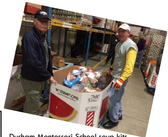
Durham Montessori School soup kits