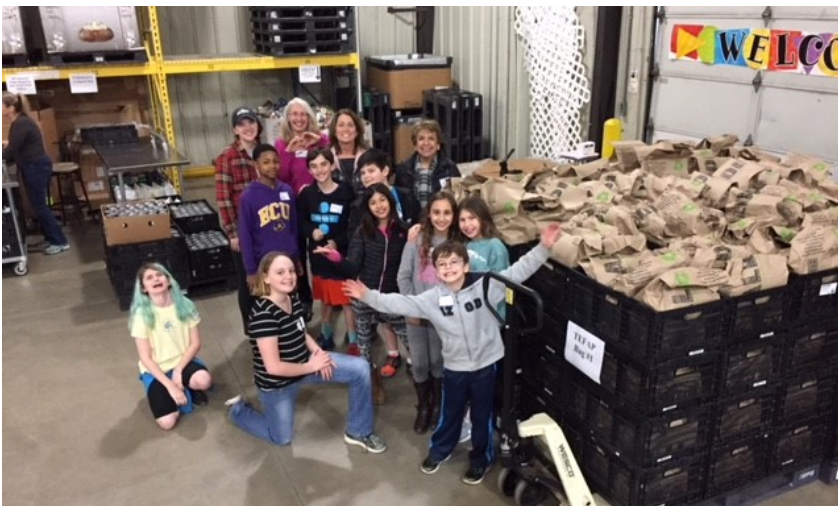
Montessori School of Raleigh packed 4 pallets of TEFAP food! They are 4th, 5th, & 6th graders.

2013 Raleigh Blvd. Raleigh, NC 27604 Phone: 919-873-0245 Fax: 919-872-0260 Website: www.cporaleigh.org