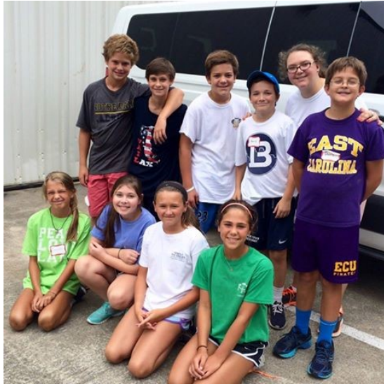
Our Lady of Lourdes Mission Camp, who volunteered in August